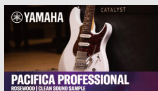
Pacifica Professional Clean Sound Sample