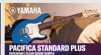
Pacifica Standard Plus Clean Sound Sample

*Click here for the sound sample video of the Maple fretboard. >