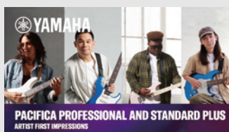
Artist First Impressions