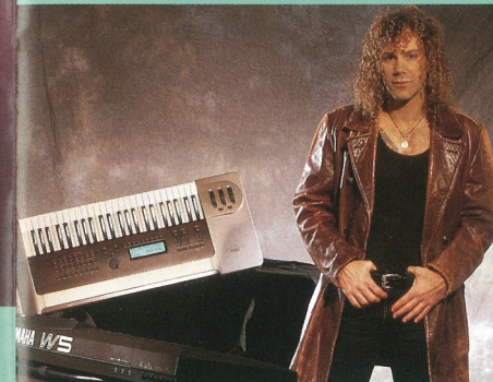
David Bryan of BON JOVI