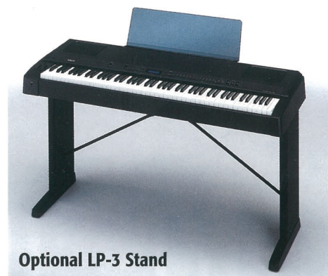
Optional LP-3 Stand