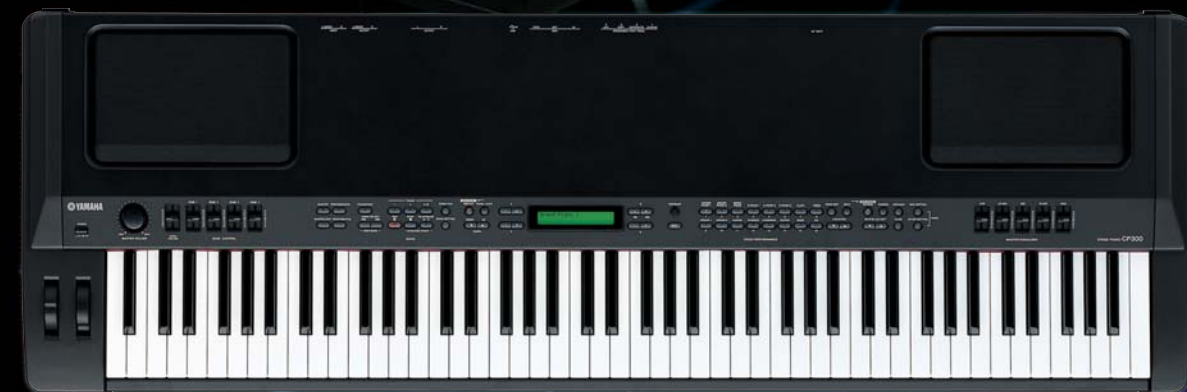
STAGE PIANO CP300

Drawing on our rich tradition and experience, these instruments give the live performer all the sound and expressiveness of a superbly mic'd grand piano with the portability and versatility of a modern digital instrument. Introducing the new standard in stage pianos—the CP series.