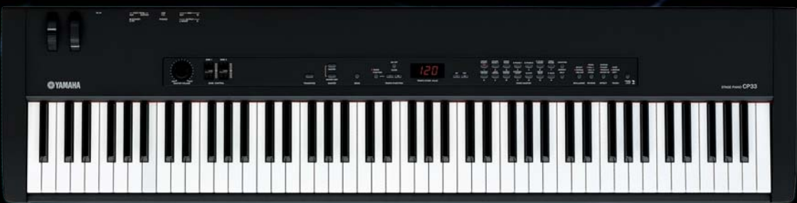
STAGE PIANO CP33