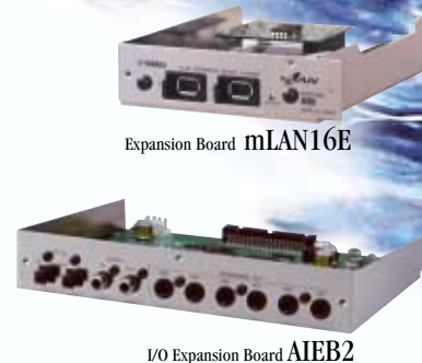
Expansion Board mLAN16E